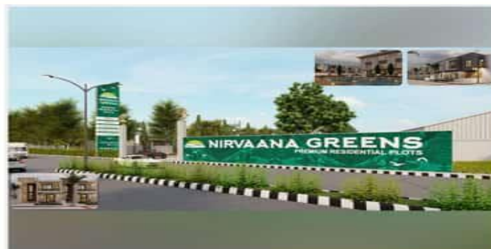
Nirvaana Greens: Premium Residential Plots in Haridwar