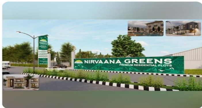
Nirvaana Greens: Premium Residential Plots in Haridwar